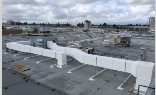
Certain sizes of Thermaduct can be made in 13 foot sections, cutting down on required connections

A perfect duct would not promote or harbor the growth of bacteria and would not allow air to leak in or out of the duct. Thermaduct is Kingspan KoolDuct fortified, offering performance that exceeds the standards of other duct offerings today. Consistent delivery of air over a non-corrosive aluminum surface with no open fibers over closed cell rigid thermoset resin insulation makes Thermaduct a perfect IAQ solution for your high specification outdoor ducting project.