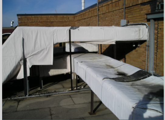
A variety of factors can degrade your duct and insulation's performance. What will your R-Value be next spring, summer, fall and winter?

More imminent in most duct systems is migration of water into the air passage system. The proof is on the roofs of buildings that employ outdoor ductwork. Over time the performance of the moisture barrier degrades to a point where moisture is allowed in. Moisture reduces the performance of the insulation and augments microbial growth either on, or in, the duct.